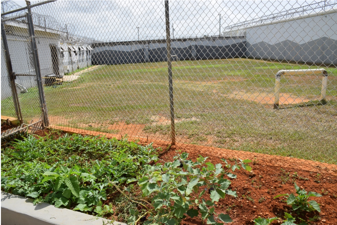
Photo: Football field and Garden

The general population continues to engage in other physical activities such as organised football matches and gymnasium training. No other physical activity programmes currently exist.