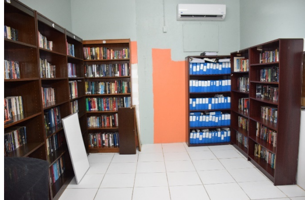
Photo of Library and Computer area